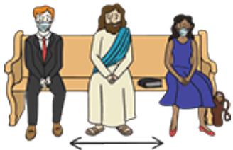
Please sit 6 ft. apart

Don't forget to wear a mask when you go to the rectory. Or anywhere else. Your life matters.