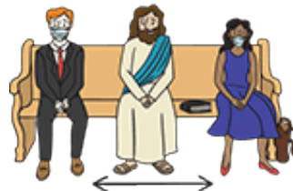
Please sit 6 ft. apart

Don't forget to wear a mask when you go to the rectory. Or anywhere else. Your life matters.