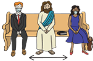
Please sit 6 ft. apart

Don't forget to wear a mask when you go to the rectory. Or anywhere else. Your life matters.