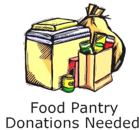
Food Pantry Donations Needed

If you are in need of food, please call the rectory We are in need of juice, mixed vegetables, cereal, small bags of rice, can tuna, and chicken. Please do not bring perishable items. Thank You.