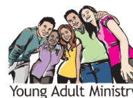
Young Adult Ministry