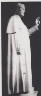
ROSEDALE, NEW YORK

COME PRAY THE ROSARY at 8:30 A.M. Mondays through Saturdays.